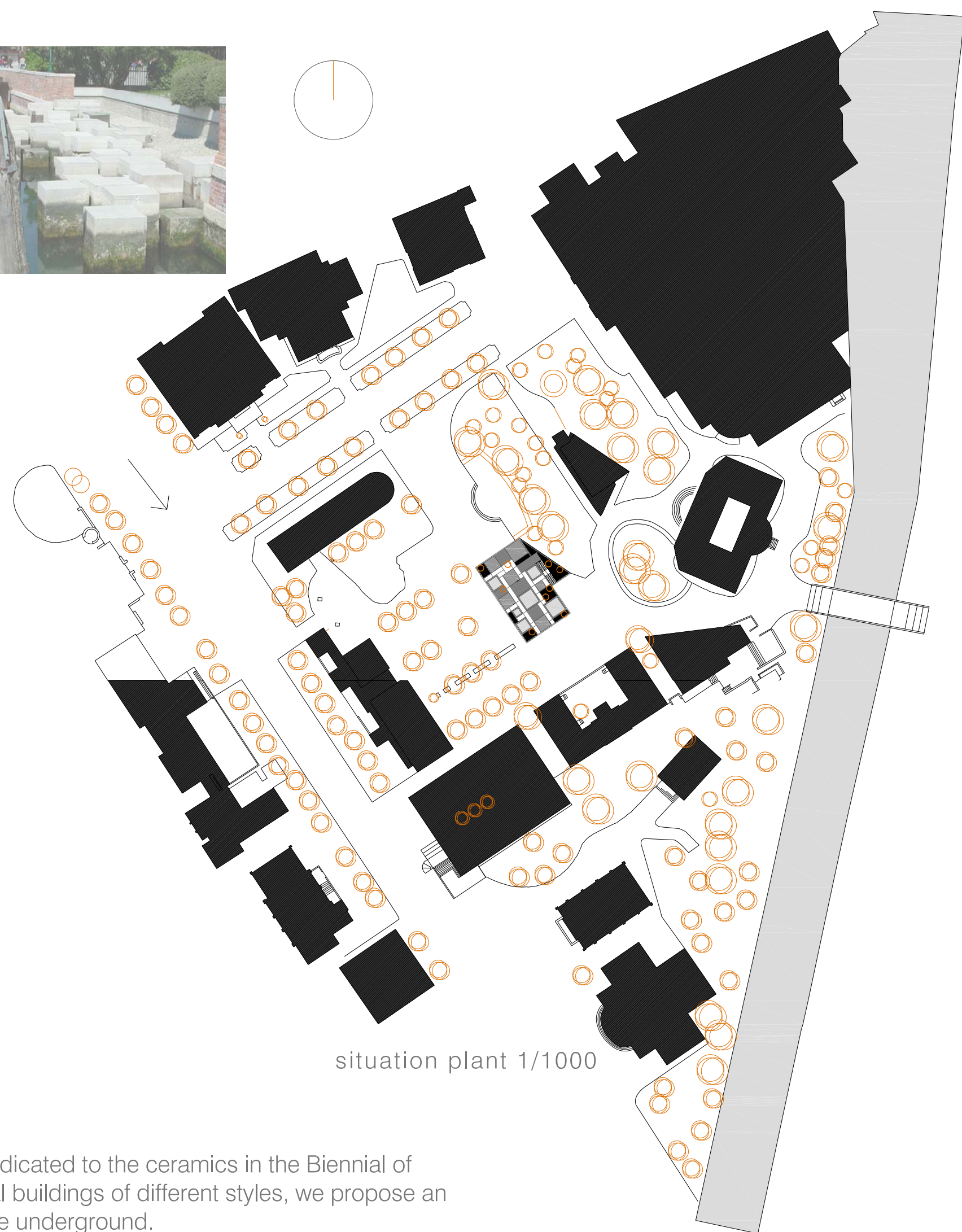
situation plant 1/1000

Faced with the challenge of building a pavilion dedicated to the ceramics in the Biennial of Architecture of Venice, and surrounded by several buildings of different styles, we propose an abstract work which develops its main programme underground. Different from the unity of the adjacent pavilions and because of its central position, we bet on building a sequence of open elements for not closing the space and let a fluid connection between the square and the different pavilions. On one hand, these boxes work as a piece of access and several services. On the other hand, they act as true traps which provide the room natural light. The generated space among the boxes is thought to be a route of staying places, gardens and even to organize outside exhibitions. By means of the stairs framed by both brick walls to get to an open, abstract and fluid space with natural light in which the brick is essential, painted in white, to make the most of the light. The big skylights mark a spiral route and the display stands arrange in a way which creates a movement. At the same time, the high of the boxes varies searching for the eldest amount of light. Finally, in the background, a little volume with a secondary access contains service spaces.