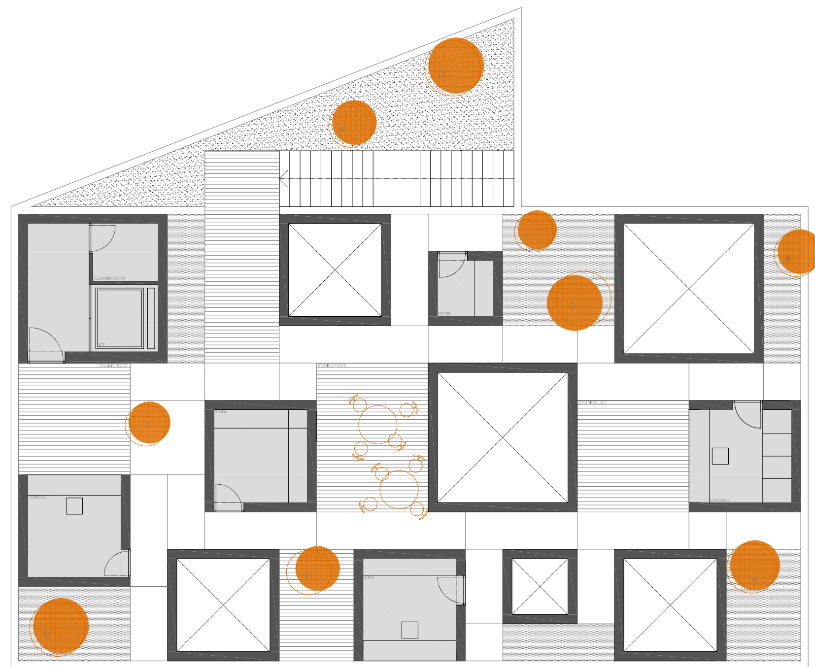
ground floor 1/100